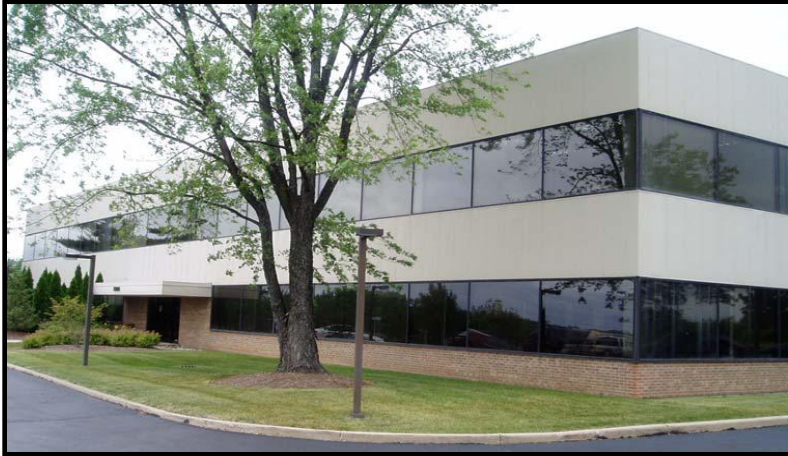
1300 South Grove Avenue

1250 – 1300 S. Grove Ave., Barrington, IL 60010